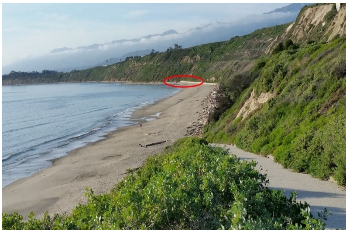
Where to find us: Designated clothing-optional area starts at the concrete rockslide