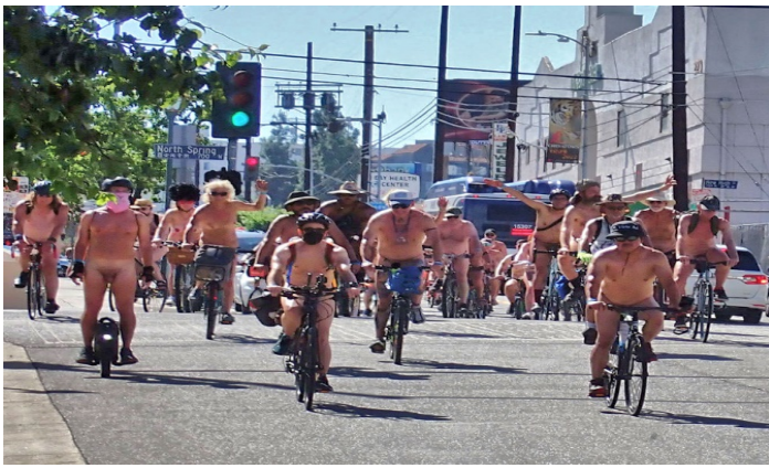
Many members of Friends of Bates Beach participated in this annual nudist event.