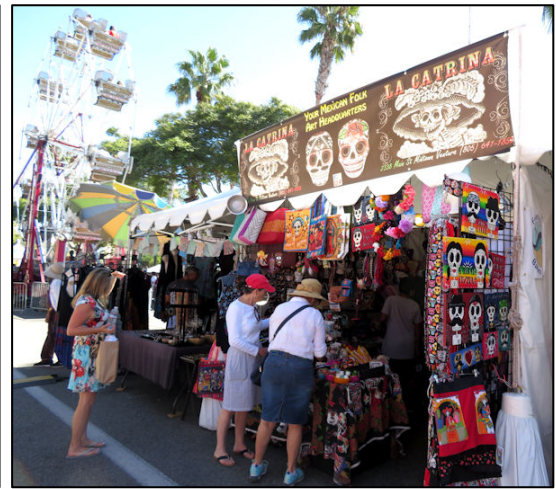
Among the 100 food vendors were those selling fried avocado and avocado brownies. By Sunday the festival was out of avocado flavored ice cream and avocado beer. Other booths sold clothing, signs, and jewelry.