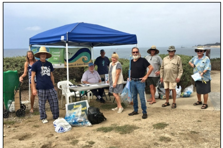
Noon Photo of Cleanup Crew. People kept coming and going so it was impossible to keep people around to be in one complete photo.

[Note: To remove the tar, some people mix a baking soda paste while others use nail polish remover, WD-40 or baby oil. Goo Gone, a solvent available at most drug stores, also works. One FOBB member always wears an old pair of socks while near the waterline.]