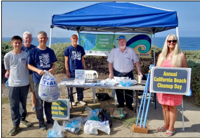
Beach cleanup crew at 10 am Saturday Morning