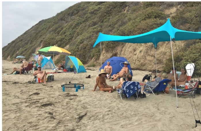
Thanks to all the members who are sending us photos from their experiences at Bates Beach. We will continue to share these with our readers as space allows. – Editor