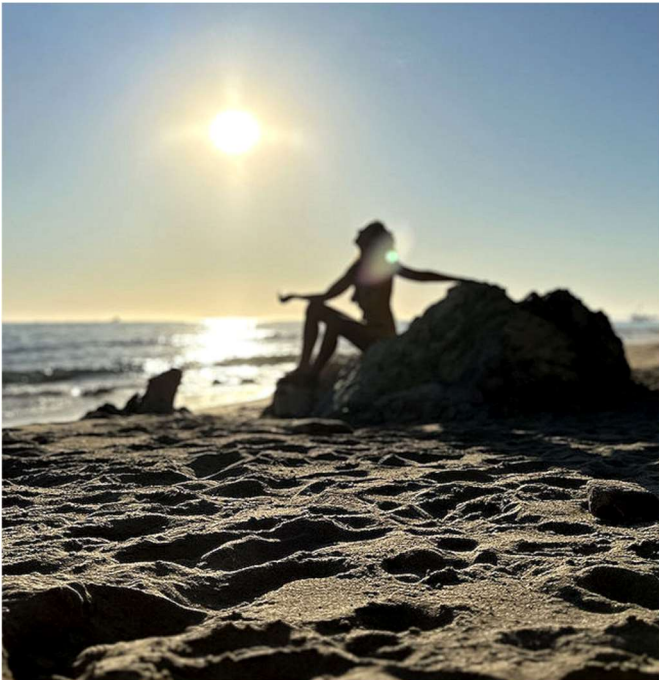
Phot Album of 2023. See Page 4

Friday, Mar xx, 6:45 PM Member's Dinner Meeting, Ventura Tuesday, Mar xx, 7:00 PM Online Meetup