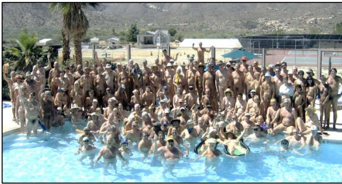
Happier Times at De Anza: 2005 Naturist Society Western Gathering

The sale and potential sale of the nudist property, changes in club policy, and replacement of longtime managers have rocked the nudist community in California this year. The ripple effects are still widely felt as these stories continue to play out into the new year. In chronological order: